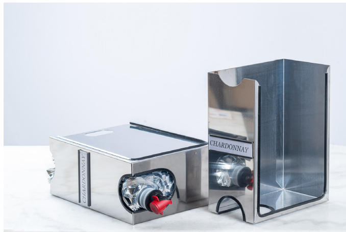
STAINLESS STEEL BAG BOX