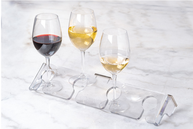
PETG GLASS SHELF