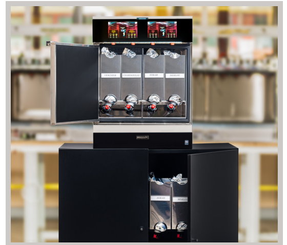
ALSO USEFUL TO KEEP READY TO QUICKLY REPLACE THE WINES IN THE MACHINE