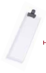
OPERATING METHOD KIT FOR RED WINE ZONE AND WHITE WINE ZONE