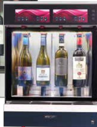
TWO-COLOUR BOTTOM DRAWER KIT